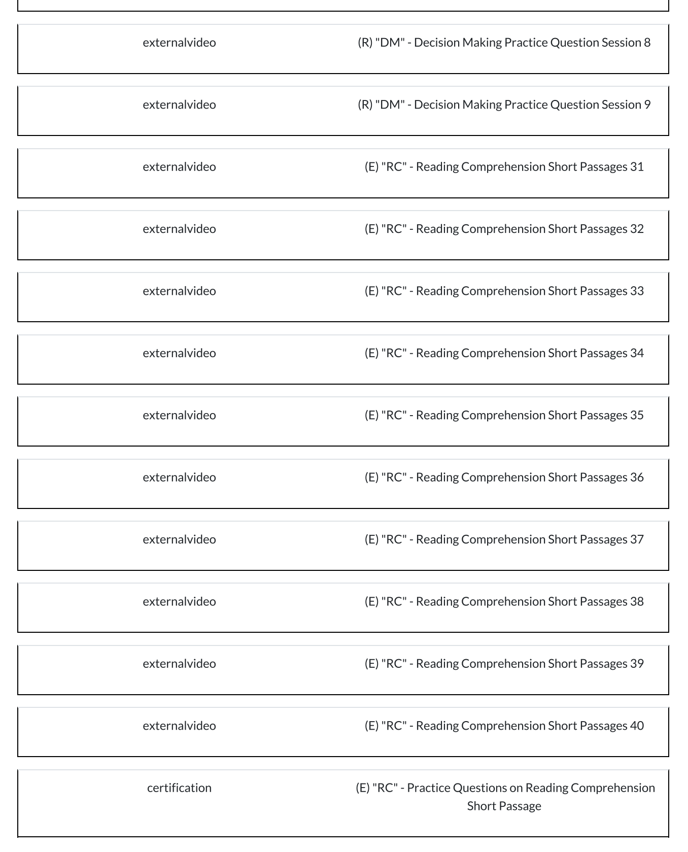
Day 95 - (M) "M" Mensuration 2D, (R) "SI" Statement and Inference, (E)